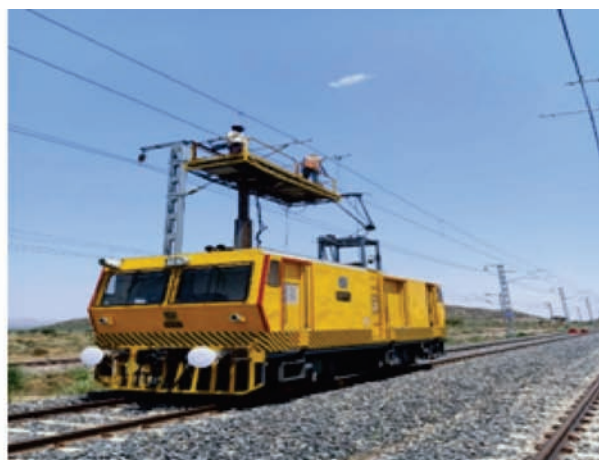
Mechanized inspection of works using rail borne vehicles such as Vertical Cradle Platform (VCP) and tower wagon etc.