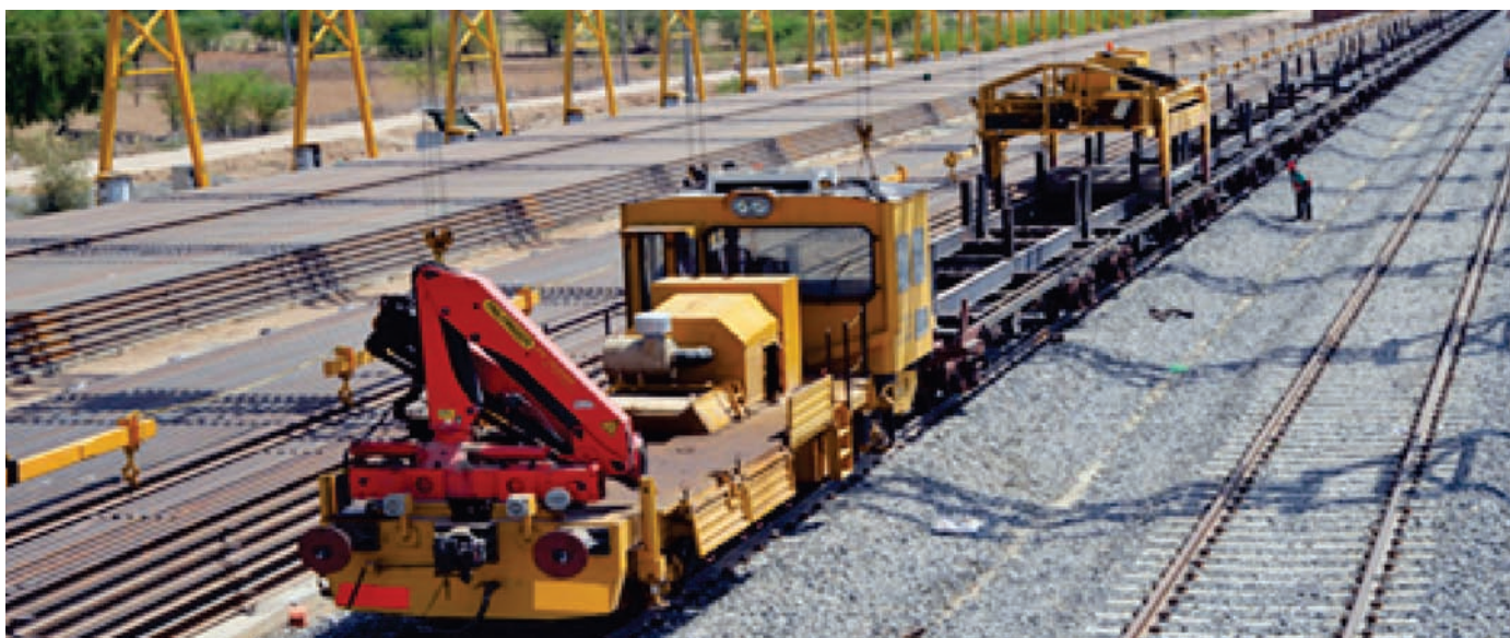
Rail Welding Deport at Rewari-Madar Section