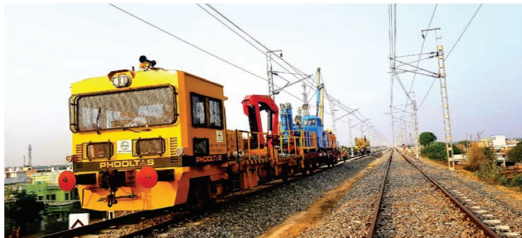
Mechanized wiring train for simultaneous wiring of OHE conductors