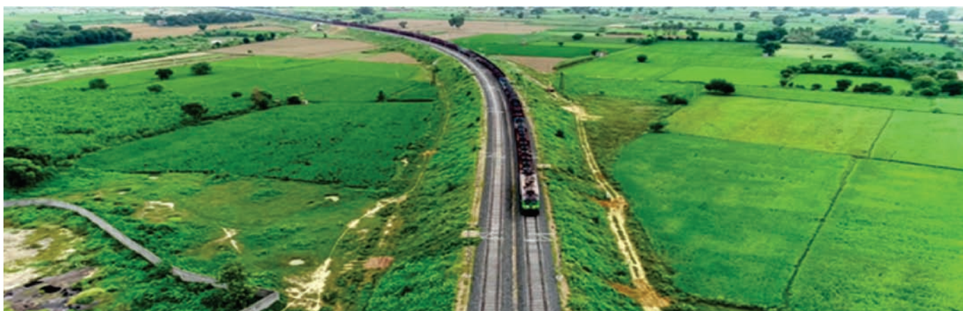
First Heav Haul Train (1.5 km Long) in Khurja-Bhadan Section on 14.09.19