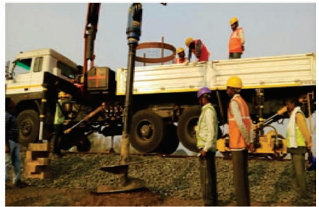
Foundation auguring by rail based mobile augur