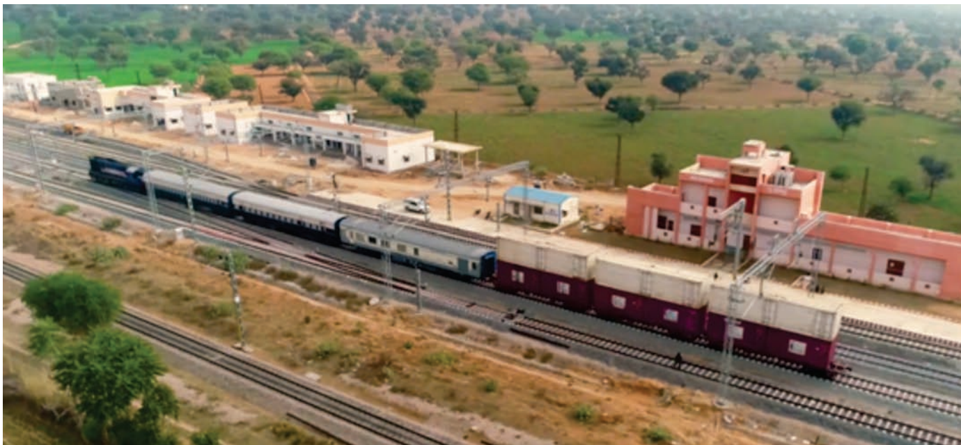
Successful Oscillation trials for 25 tn axle load trains at 110 kmph in Rewari-Phulera section of WDFC on 20.01.2020