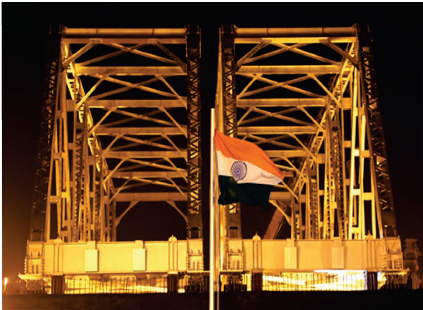
Launching of 160 T, 48.5 m open web through girder in Rewari - Dadri Section on 25.01.2020