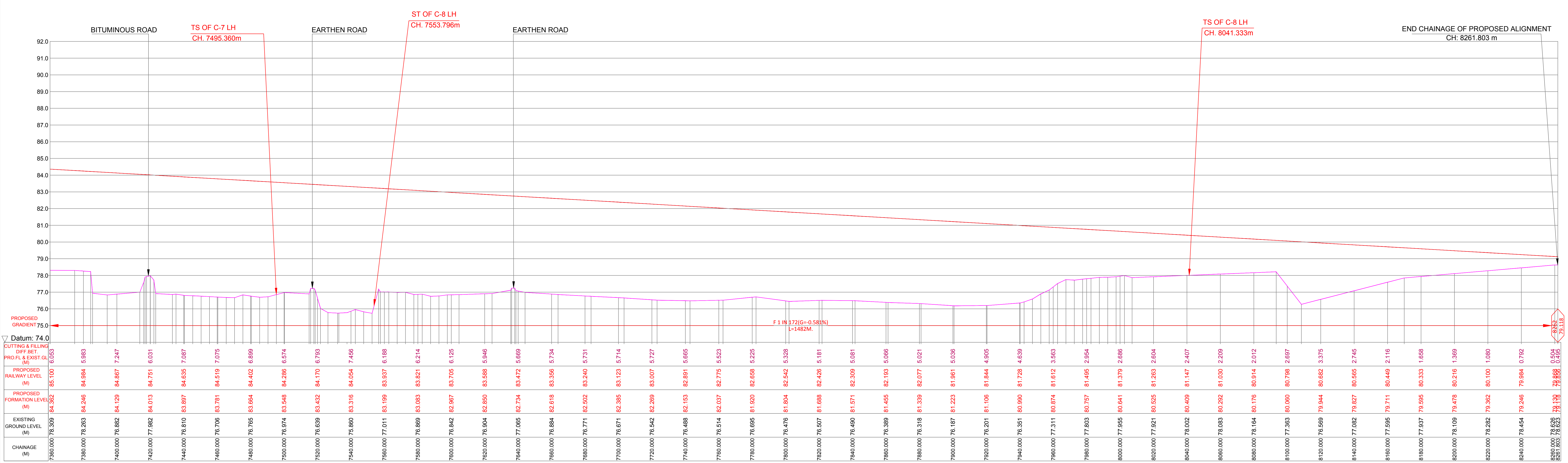
LONG SECTION PROFILE