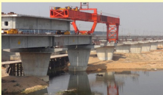
Girder Launching at Sone Bridge