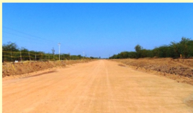
WDFC- Subgrade work under progress in CTP-1