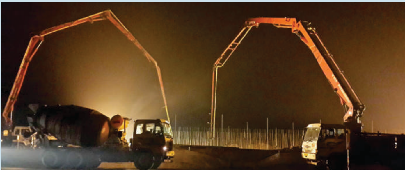
RUB work in progress in WDFC