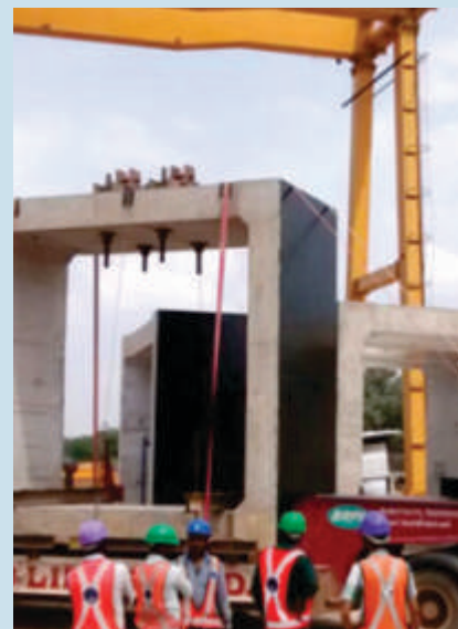
Precast segment staking, transportation and erection