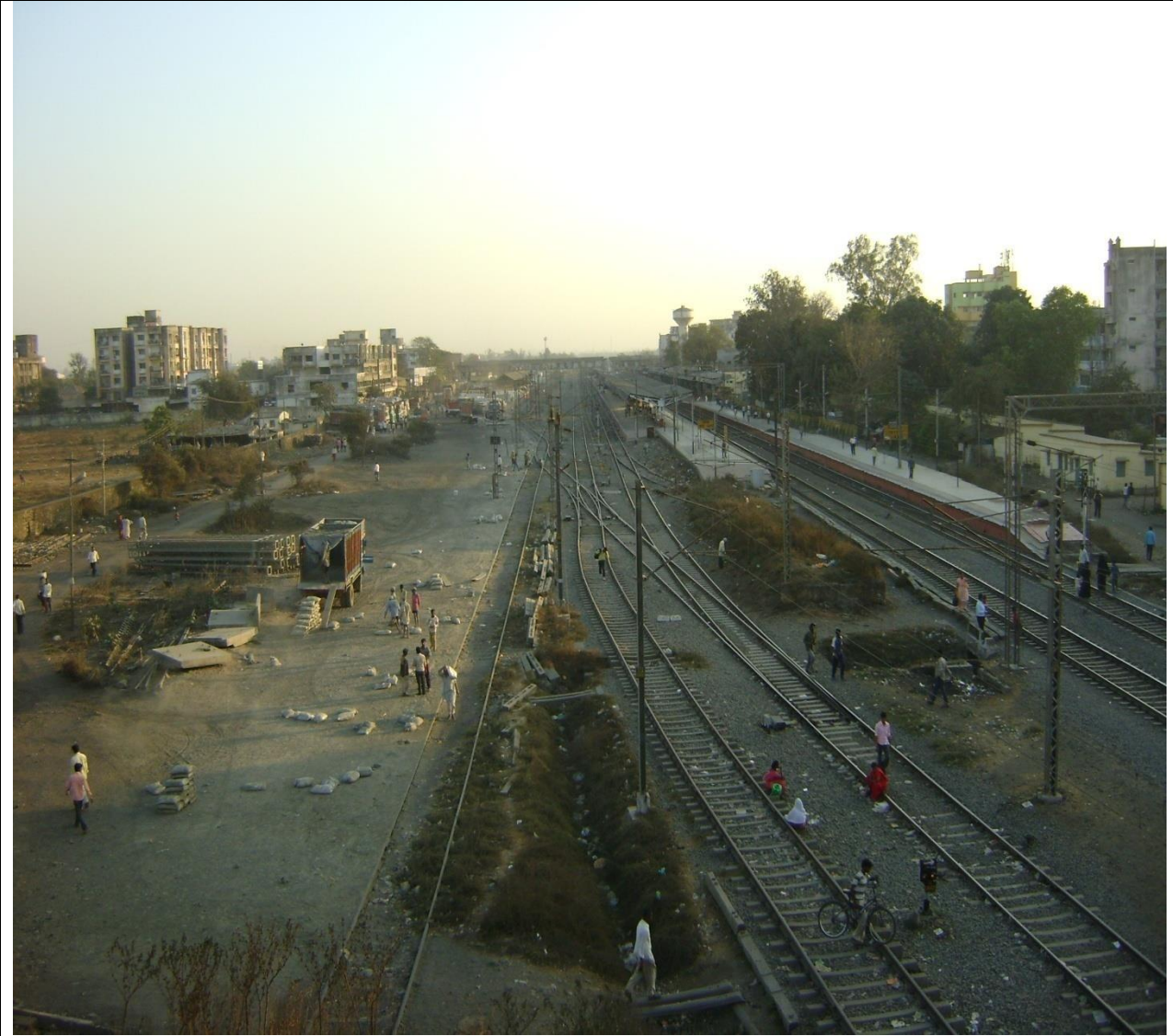
Vapi Station (Existing IR lines)