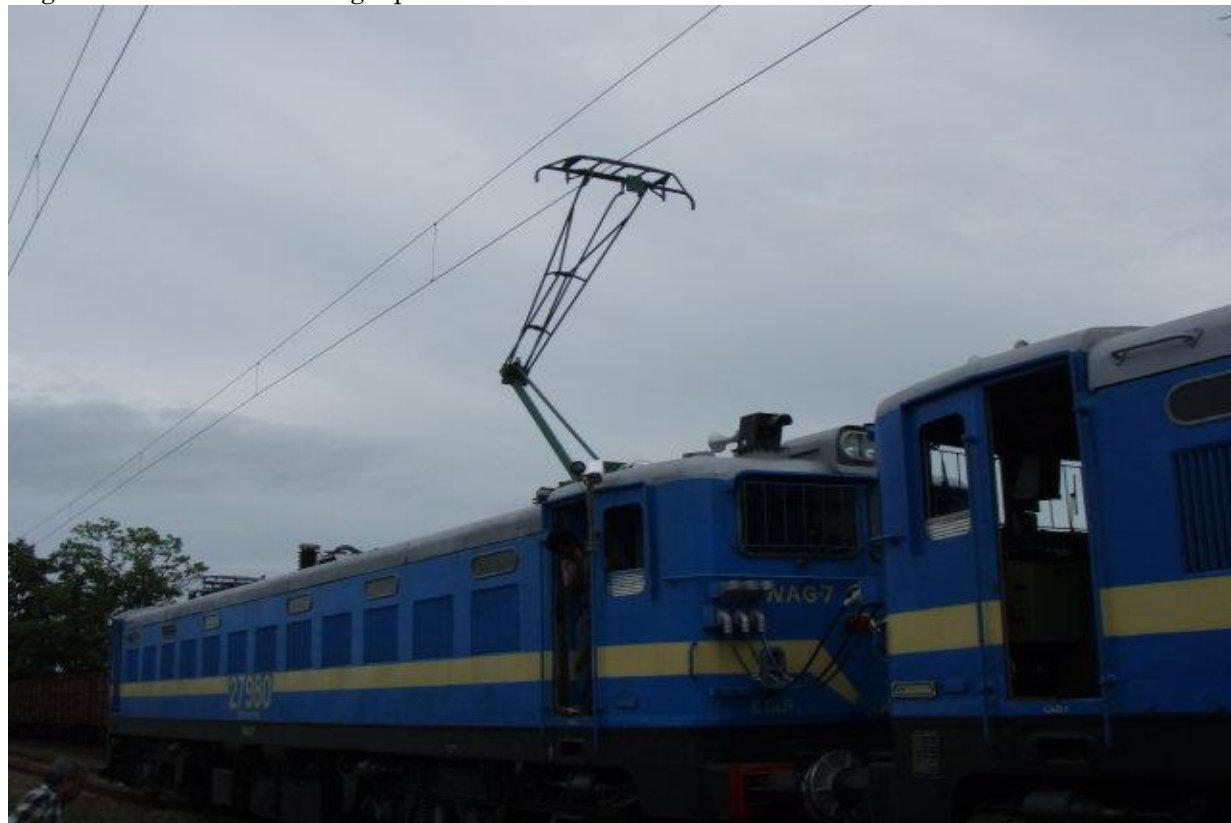
High Rise OHE and Pantographat test section in State of Orissa