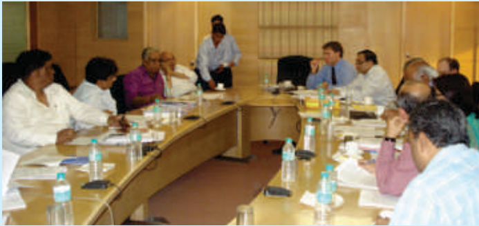
World Bank delegation meeting with DFCCIL on 21 st March

The final location survey in Sonnagar – Dankuni section of 534 kms has been completed