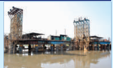
Pile Boring– Bridge 93 (on North Vaitarna river)