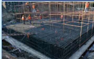
Pile cap reinforcement – Bridge 358 (on South Kaveri river)