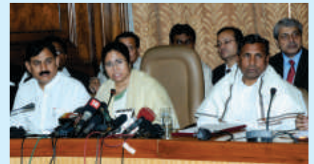
DFCCIL in railway budget

The Hon'ble Union Minister for Railways, Kumari Mamata Banerjee interacting with the media persons after presentation of Railway Budget 2011-12, in New Delhi on Feb 25, 2011.