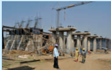
Abutment work– Bridge 228 (on Sanjan river)