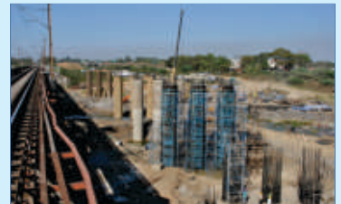
Pier work – Bridge 287 (on Kolak river)