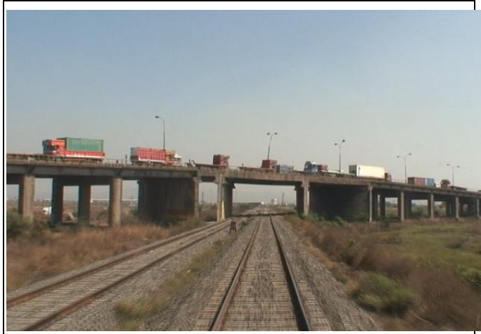
(1) ROB on JNPT Approach (To be reconstructed)