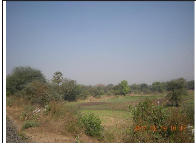
(2) Site near Panvel (Viaduct to be constructed)