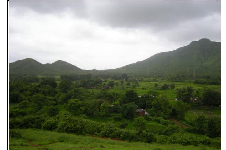
(4) Vasai Detour Section (View to South Tunnel)