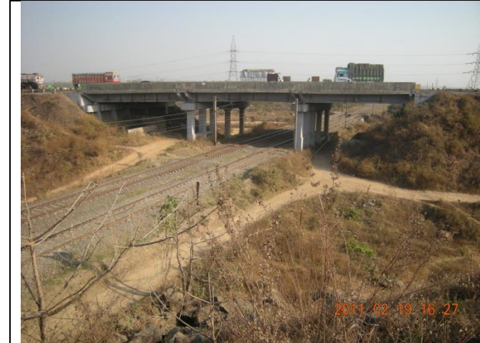
(3) ROB near Ulhas River (To be reconstructed)