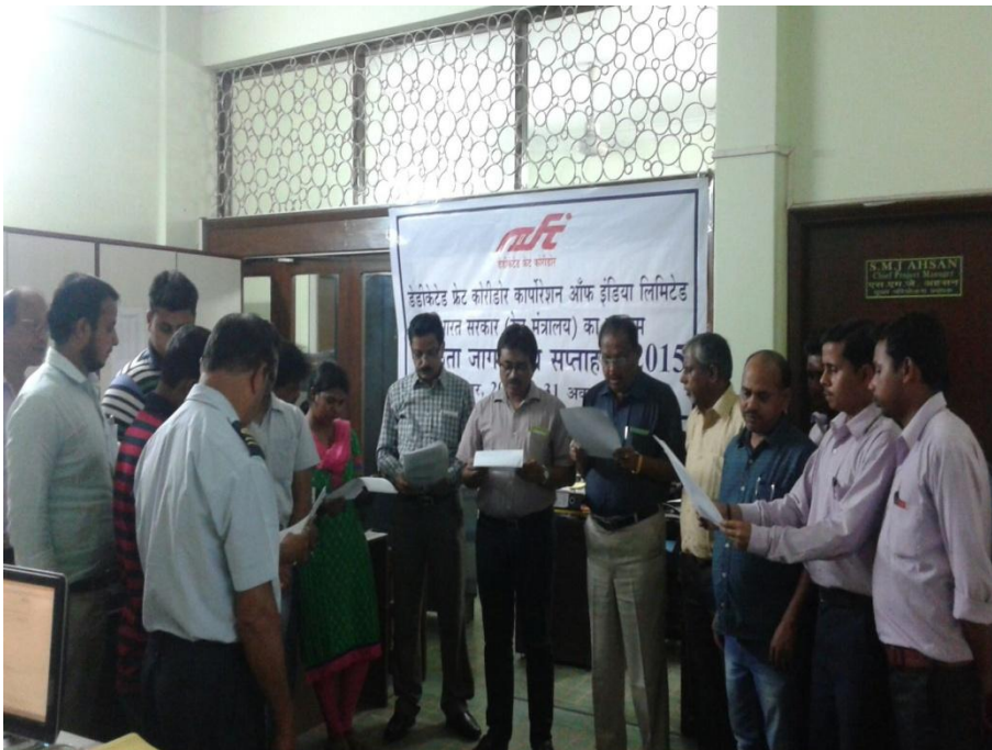
Pledge taking at CPM/Kolkatta office