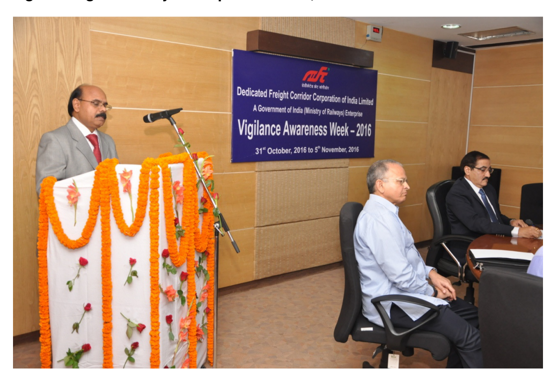
Pledge Taking ceremony in Corporate Office, New Delhi.