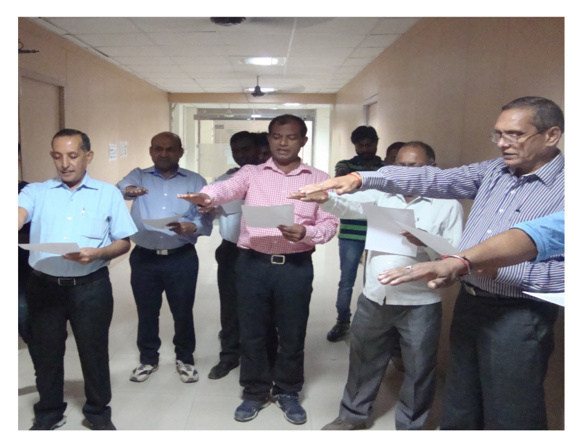
CPM/Allahabad (E) & (W)