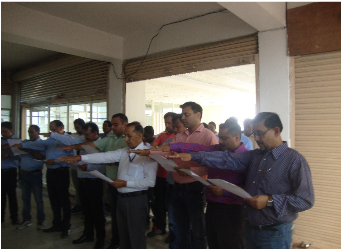
CPM/Allahabad (E) & (W)