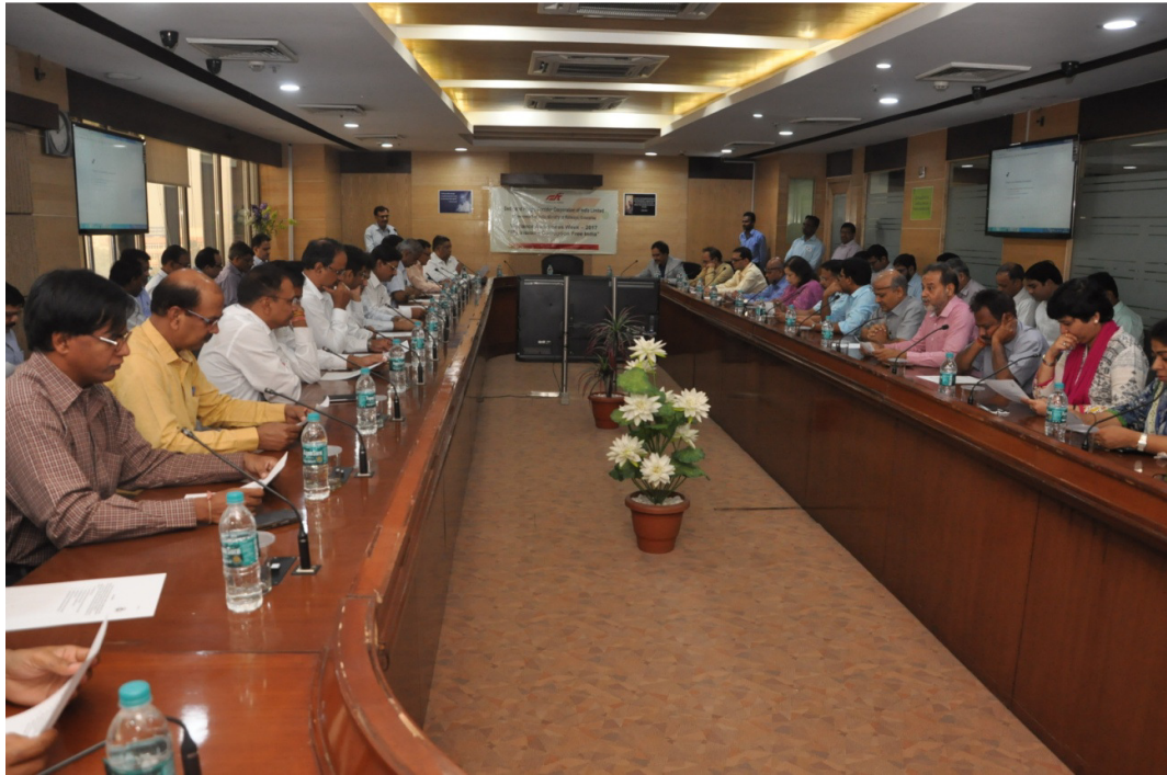
Pledge Taking ceremony in Corporate Office, New Delhi.