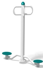
Fig:- Double Twister