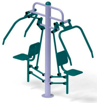
Fig:- Chest Press