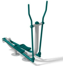
Fig:- Cross Trainer