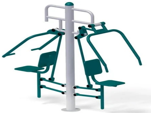
Fig:- Seated Puller