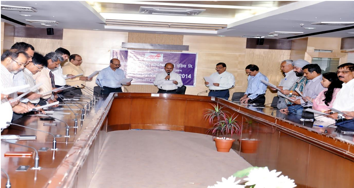
Pledge taking ceremony at corporate office new Delhi

in all the spheres of their activities in future also and to take the oath as to be read out.